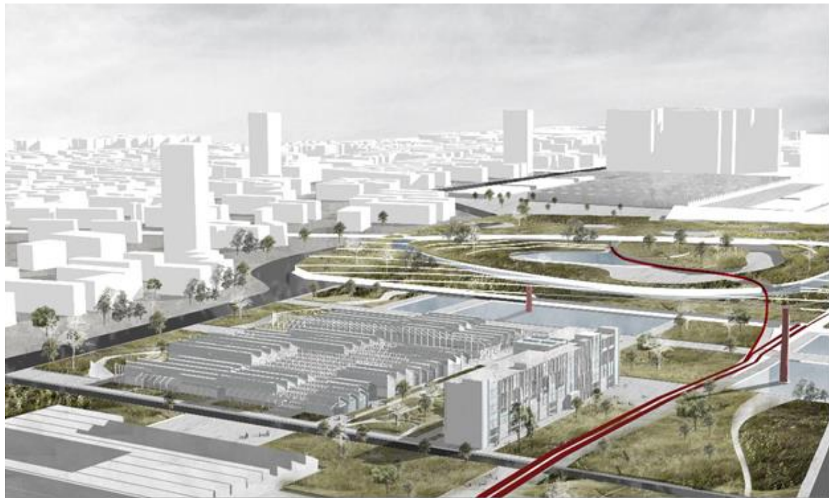
Figure 4. Effect Picture.