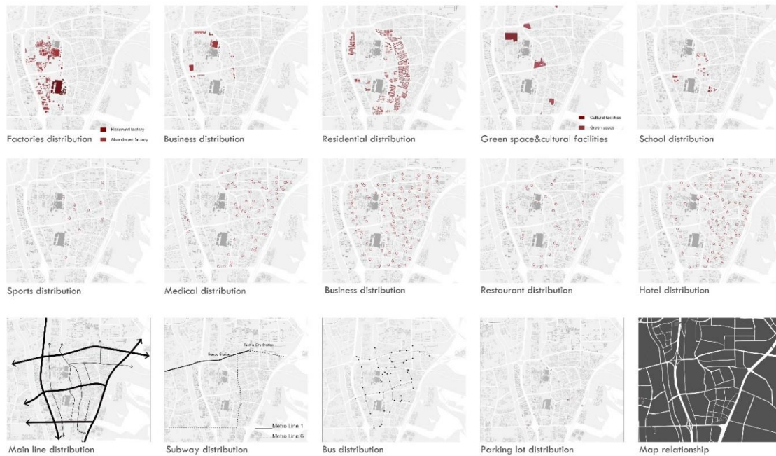
Figure 2. Status of Communities Around the Textile City.

arranged along the north-south direction, corresponding to their corresponding units, most of which are unit-based communities 10 .